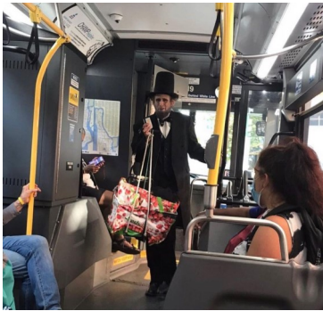
On the Broadway bus, NYC

Non-Profit Organization U.S. Postage PAID Springfield, Illinois Permit No. 500