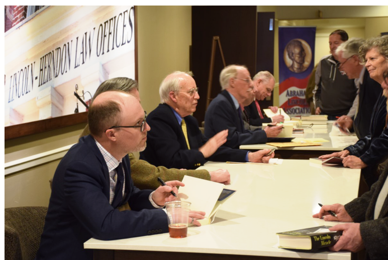
All six authors signing books for the symposium attendees