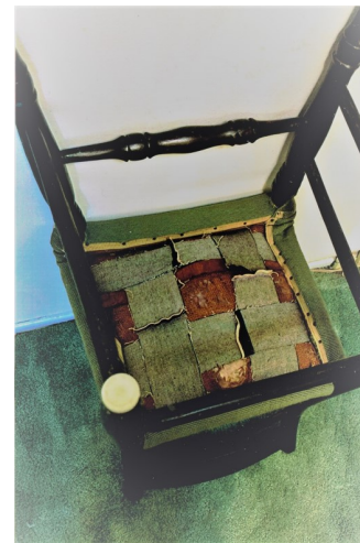
The chair's seat is now reupholstered with needlepoint, but the underside is original. Photo taken in Kimmich family home in Canoga Park, California, 2022.

— Wayne C. 'Doc' Temple turned 99 on 5 February 2023. He received more than 100 cards, including proclamations from the Governor, the Joint Chiefs of Staff, and the White House.