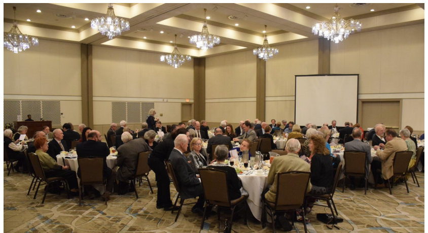
The western territory of the busy banquet room